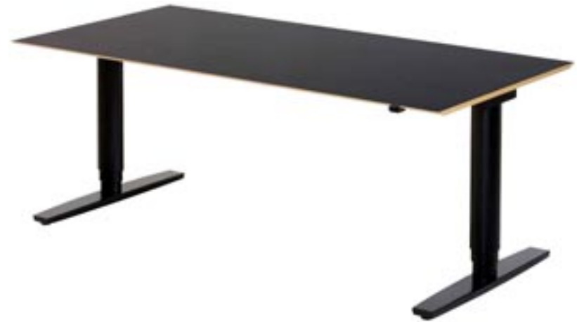
The ultimate work table: an elegant and practical work table with sit-stand adjustment

Do some relaxed arm stretches to counteract the effects of using a keyboard.